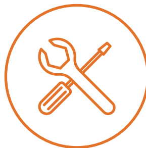
Fire Stopping Installation