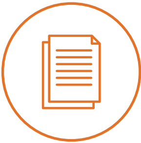
Fire Safety Services

No matter what passive fire protection challenges you may encounter or what type of building you oversee, our highly skilled contracts managers and on-site teams possess extensive expertise to effectively resolve them while minimizing any interference to your daily operations.