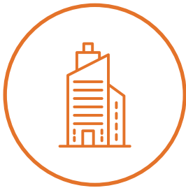
Hotels & Leisure