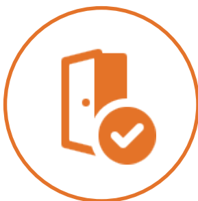
Fire Door Installation