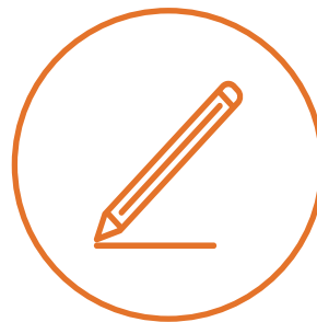
Fire Stopping Survey