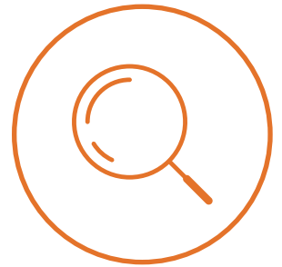
Fire Door Surveys