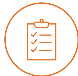
Post Installation Inspections